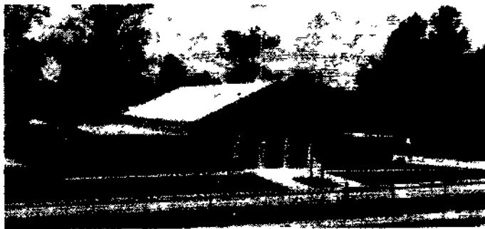
NEW CHURCH IN LOUISVILLE, KY.